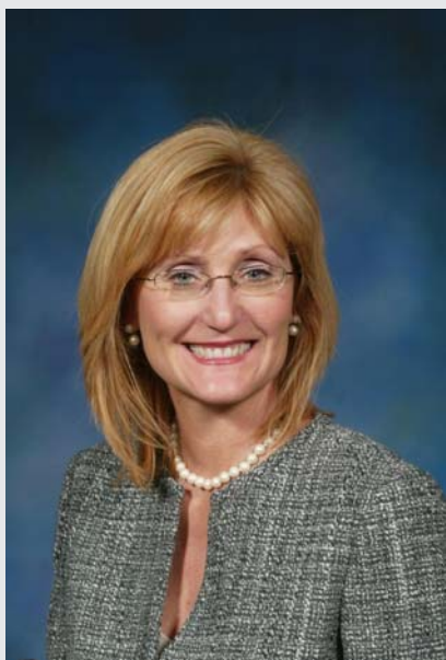
Sr. Regional Manager, Affiliate Sales & Marketing, QVC WICT Member Since 1987